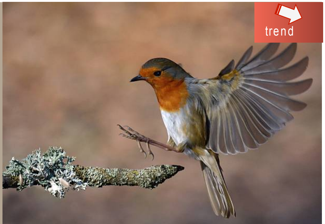
Perenatge of the robins in Europe from 1980 to 2019

There is a different robin, the american robin which is more dark, with a dark head.